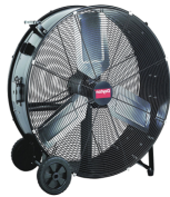
AIR FANS INSIDE BOOTH