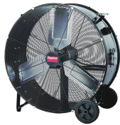
AIR FANS INSIDE BOOTH