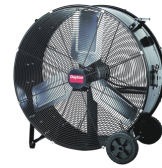
AIR FANS INSIDE BOOTH